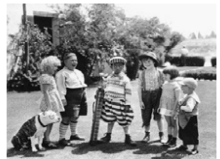
MOCSEM OFFICERS 2006