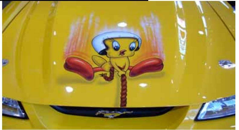
TWEETY BIRD 06 MUSTANG – ROXANNE SHEPARD