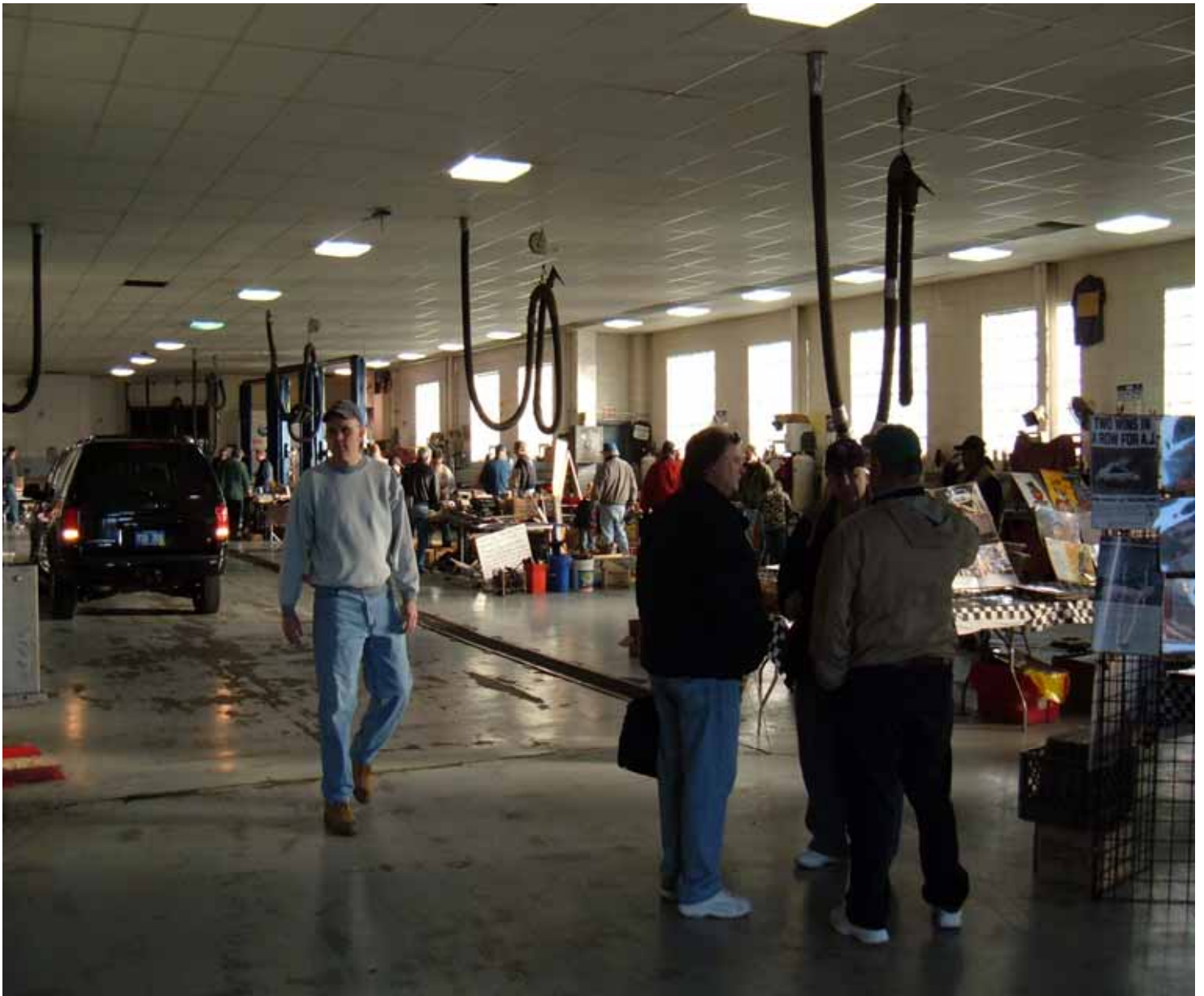
MOCSEM SWAP MEET 2006 VILLAGE FORD